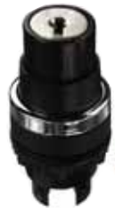
Push Key Push Button. Manual push "In". Spring return. Turn key counter-clockwise to lock "Out"; clockwise to unlock. Key withdrawable locked or unlocked. Black only.