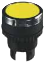
Flush Push Button. Manual Push "In". Spring Return.