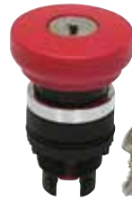
Push Key Mushroom. Manual push "In". Automatic latches "In". Turn key clockwise to release. Spring return. Key withdrawable "Out" position only. Red only.