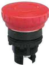
Automatic Push/Turn Mushroom. Manual push "In" Latches "In". Turn clockwise to unlatch. Spring return.