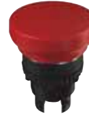
Manual Push Mushroom. Manual Push "In". Spring Return.