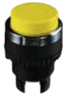
Extended Push Button. Manual Push "In". Spring Return.